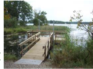
South Long Lake Community Park Fishing Pier