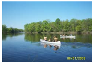
Canoe Days—Mississippi River 6/1/2008