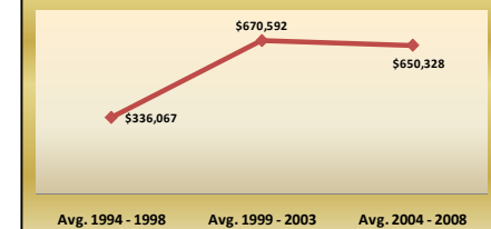
Tax Forfeited Land Sales

that generates approximately $552,300, of which a portion is distributed throughout the County to the Cities, Townships, School Districts and County Revenue/Building Fund.